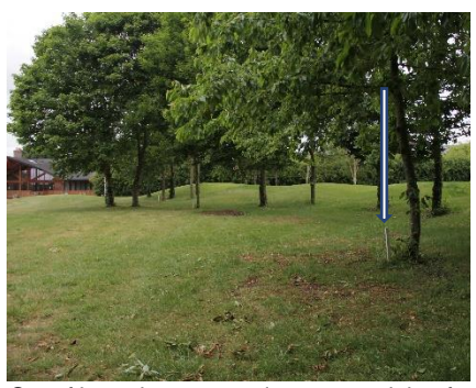
Out of bounds new practice area to right of 9<sup>th</sup>/18<sup>th</sup> green.

The new practice area in the trees to the right of the 9<sup>th</sup>/18<sup>th</sup> green is out of bounds.