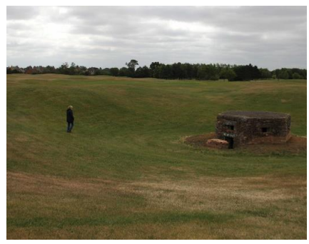
The pillbox now blends in on the course extension

We currently have some alternatives on order, which we hope will prove more robust.