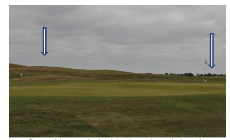
Out of bounds behind and to right of 4<sup>th</sup>/13<sup>th</sup> green.

Beyond the course side edge of the white markers to the right of and behind the 4<sup>th</sup>/13<sup>th</sup> is now out of bounds. (Rule 18.2)