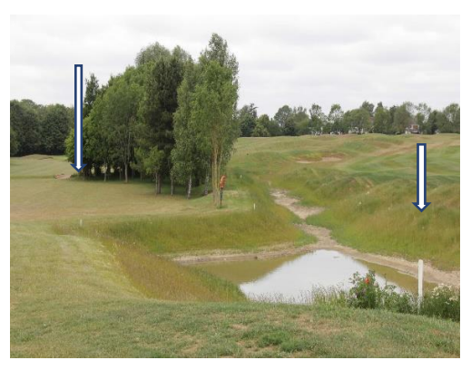
Out of bounds to right of 7<sup>th</sup>/16<sup>th</sup> hole from tee to green, including the new pond

Beyond the course side edge of the white markers to the right of the 7<sup>th</sup>/16<sup>th</sup> hole from tee to green is now out of bounds. Note: this includes the new deep pond