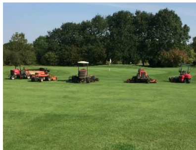
1 st Obstacle Course

On the 1 st hole there was a row of machines to go over. Made more difficult by having to tee-off from thick grass on a downslope!! If you were lucky you might not be heckled by green keepers at the same time.