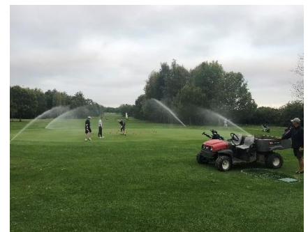
9 th The Watering Hole

Then onto the 9 th green which was covered in small red immovable flags, that meant there were no direct putts to the hole. While you were figuring out your way through this maze – someone would take great delight in turning on the sprinklers!!