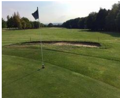
6 th Go for it & go in it!

The short par 3, 6 th hole had the flag directly behind the left-hand bunker which was marked as a penalty area. Oh! Strangely enough an outside agency, otherwise known as a green keeper, accidentally kicked your ball into the bunker!