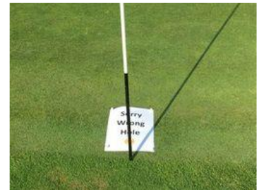
3 rd No, not this one!

Having avoided the truck in the middle of the 3 rd fairway, a good shot to the flag right at the front of the green was to be rewarded, surely. But no that was the wrong flag. The right flag, about 30cm high, was at the very back of the green at least 2 putts away!!