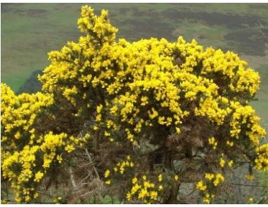
Gorse, a kingdom for my gorse!