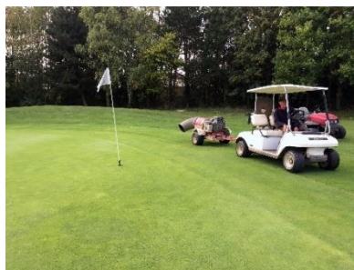
7 th A gust of wind from Mossy

Once we had negotiated that the rest of the 7 th looked to be pain free until you got the green. Wrong! You were then subjected to the whims of Mr Moss, who used the leaf blower to blow your ball towards or away from the hole on the putting green, as he saw fit. He seemed to be enjoying himself too much as he blew leaves and twigs all over your putting line!