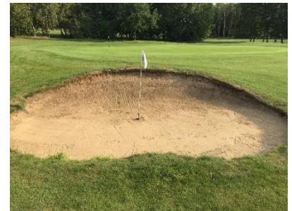
8 th If only it was always there?

bunker, your ball kicks right and bounces on to the green!!