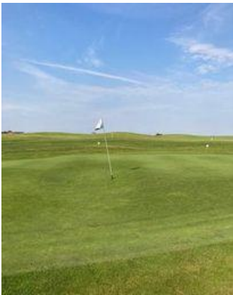
4 th How many?

Firstly, you had to avoid the extra penalty area in the middle of the 5 th fairway. Then your route to the 5 th green was blocked by a row of sleepers with a small gap in them. You could also only putt in from the side of the hole facing the timbers. Alan Little, putting from the far end of the green, decided he would bounce his ball off the timber back into the hole. Only, to see his ball sail through the gap in the timbers 30 yards back up the fairway!