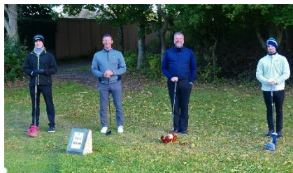
The first socially distanced 4 ball to tee off.